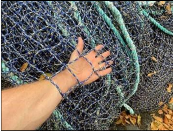
Figure 1: HDPE Netting