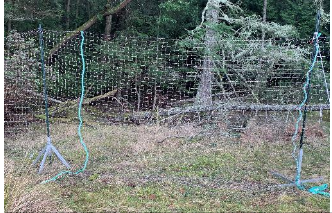
Figure 2: Netting in open area secured with free standing posts