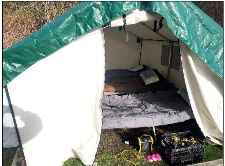
Figure 8: Canvas Wall tent with cots and sleeping bags. This photo shows 3 cots, but for this work we will have 2 cots per tent. Wall tents will also have wooden floors, wood frames, and wood walls for this work.