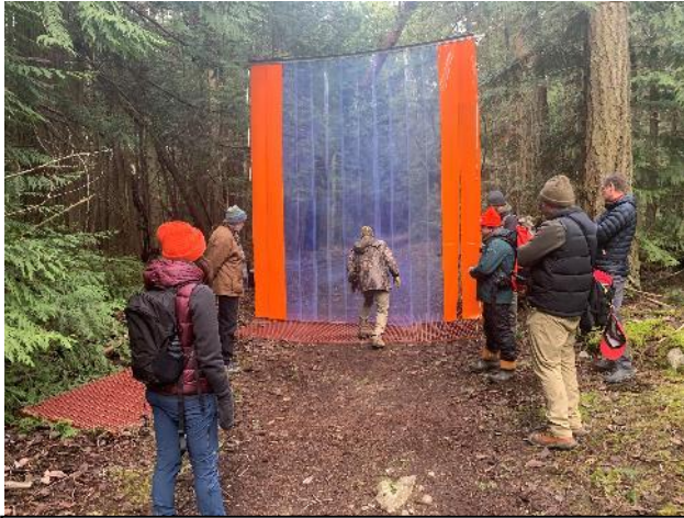
Figure 5: Vehicle Gate