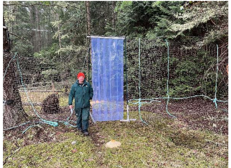
Figure 4: Pedestrian Gate