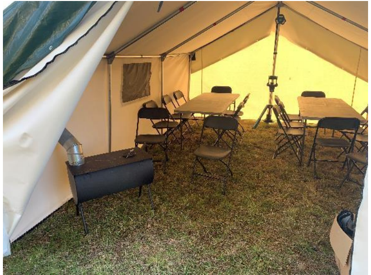
Figure 6: Heated covered area for eating/recreation