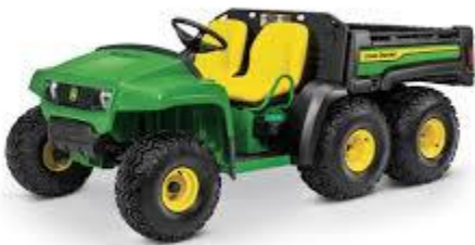
Figure 7: "Gator"