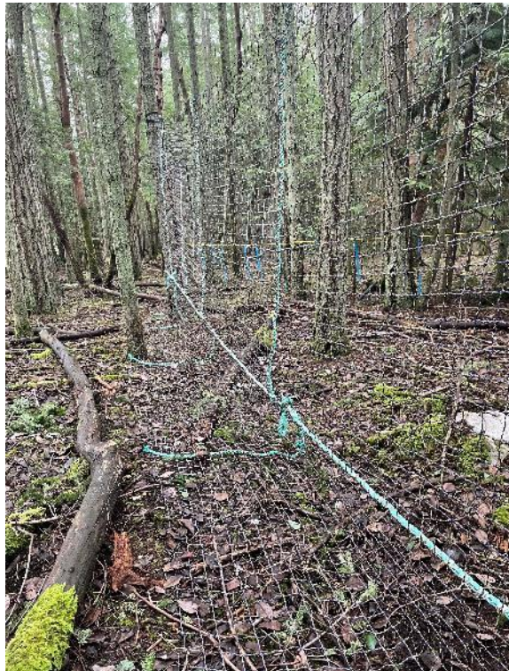
Figure 3: Netting in forested area secured to trees