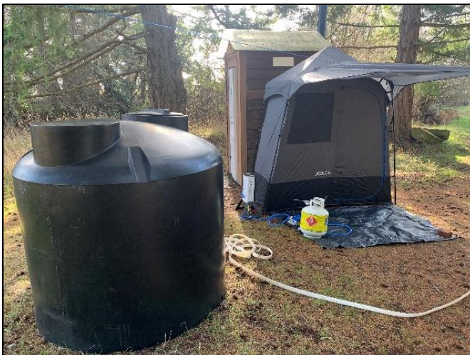
Figure 9: Heated Shower