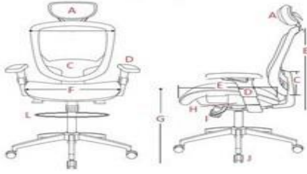
Table A1 Rotary Chairs: