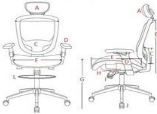
Table A2: Rotary Chairs