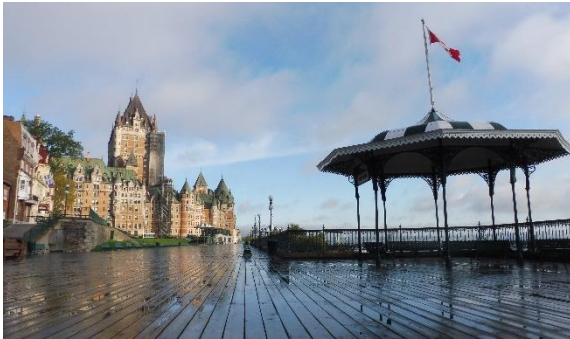
Figure 1 – Section of Dufferin Terrace