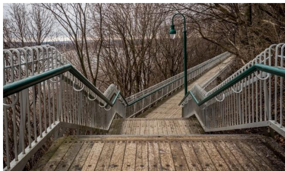
Figure 2 – Section of Governors' Promenade