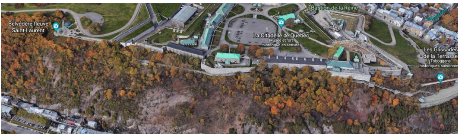
Figure 3 – General view of Governors' Promenade