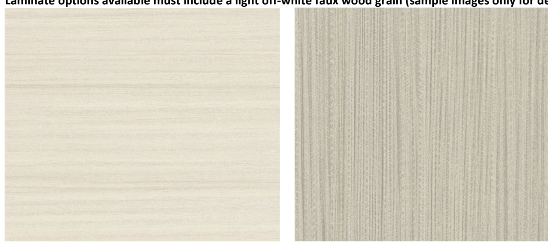
Table 1 – Product Table